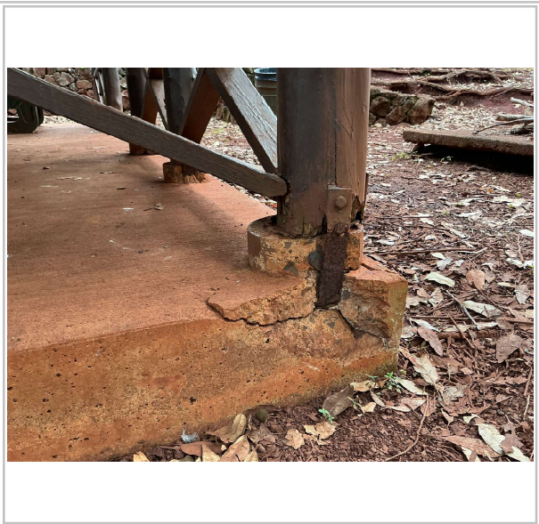
Concrete spall example