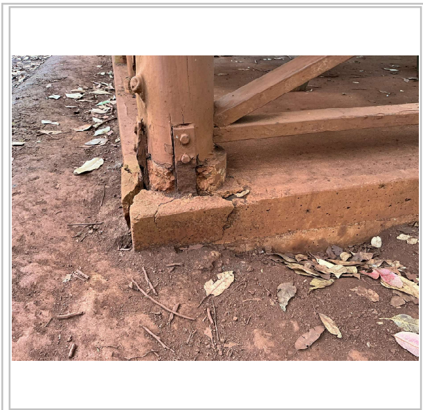
Concrete spall and corroded bracket example