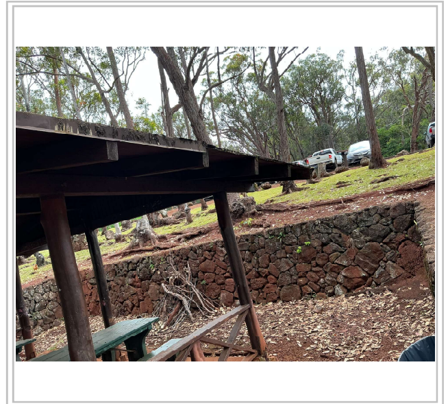
Concrete spall and corroded bracket example