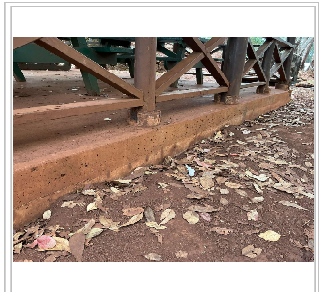
Concrete spall and corroded bracket example