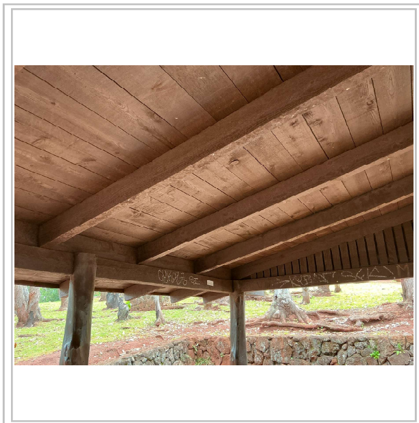
Scope of Work